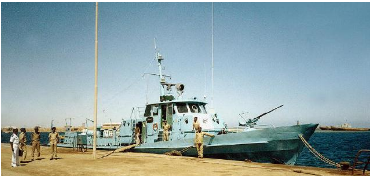
Kadir-class patrol boat

The naval force was established in 1962, it operates on the Red Sea, from the naval bases of Marsa Gwayawi and the Nile River, it has among its ranks about 1800 troops.