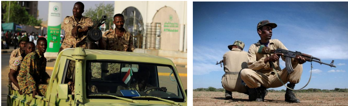
Sudanese troops on rural and urban patrol.

Sudan is an underdeveloped country, with more than 30 years of internal wars that limit economic progress. Today 3/4 of its population lives from agriculture, mainly in the valleys on both coasts of the Nile River. Since the mid-1970s it has increased its production and export of oil and derivatives, for a decade they have been the main source of foreign currency income of the nation, this allows it to carry out an important development in infrastructure.