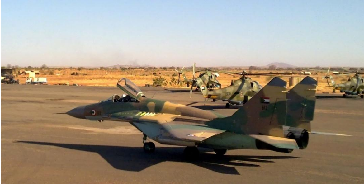
Sudanese Air Force Mig-29 fighter

Created in 1956 after independence, with British assistance, the force today has some 13,000 troops among its ranks.