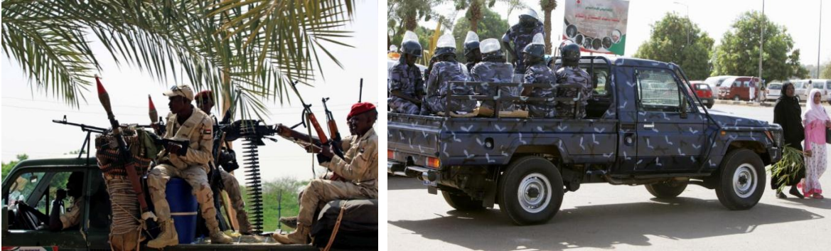
Sudanese troops on rural and urban patrol.

Presidential Federal Republic, independent from Great Britain since January 1, 1956, most of its inhabitants profess the Islam religion, the official language is Arabic and English.