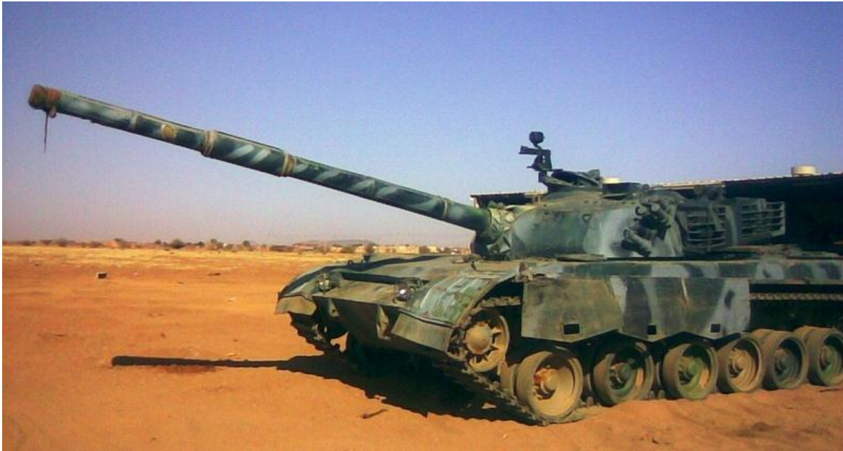
MBT Al Bashier (Type 85M-II)