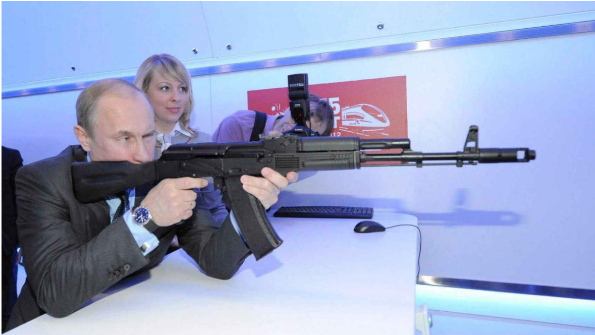
Vladimir Putin, the "murderer" of the unipolar world.

With the firmness and lucidity of a drunken uncle at that family gathering where no one has listened for decades, the North American president, Joe Biden, answered the subtle question of the journalist George Stephanopoulos, who, lacking in inspiration, was looking for a title: "Is Putin a murderer? The answer is already known worldwide: "Yes" and he added, with the characteristic temperance of North American pro men: "You will see the price you are going to pay shortly", he added without giving more details: What it could mean, if we continue the reasoning of his predecessors, that we can only hope that he will soon invade the Russian Federation, as he has done with Iraq or Afghanistan, in which thousands of natives insisted on dying under the democratic bombs of American aviation, or perhaps I sent a commando of special troops to kidnap the Russian president, and