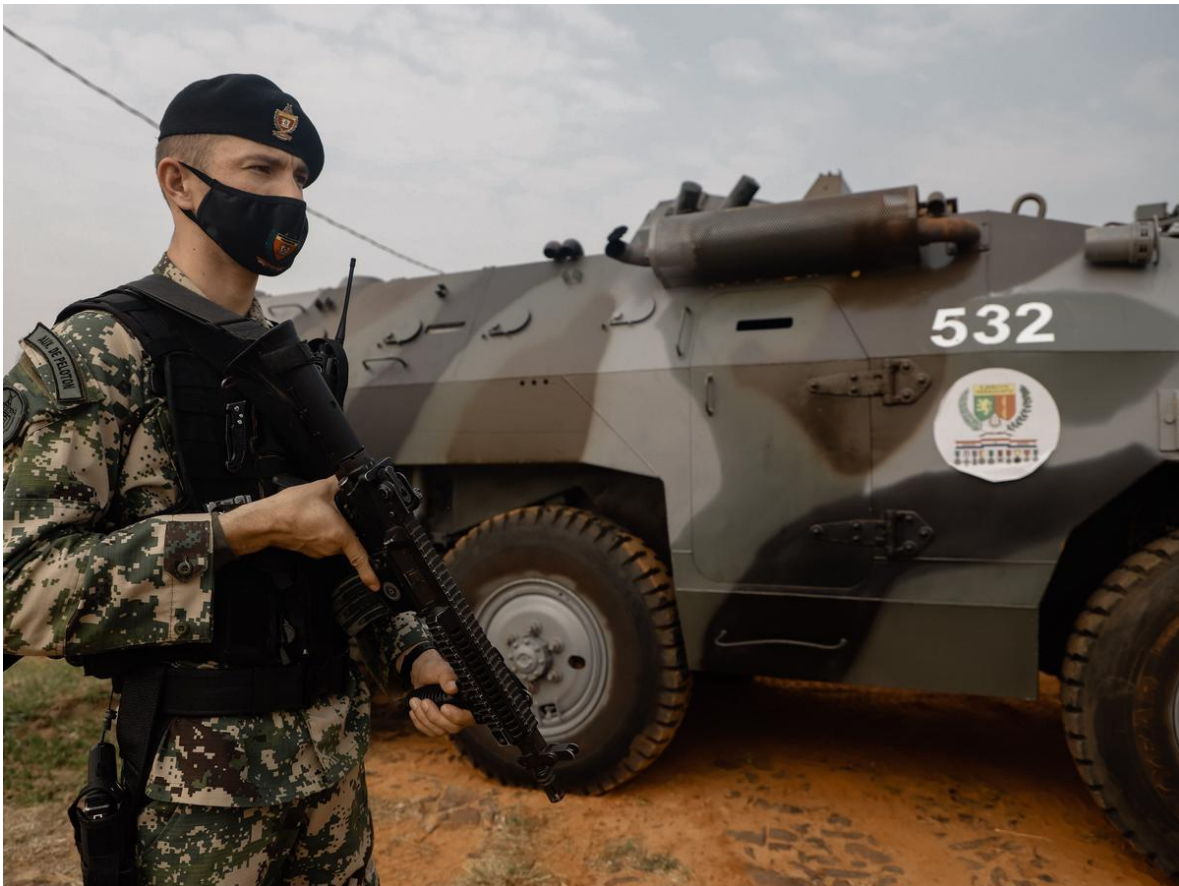
Paraguayan Army units continue to operate despite the restrictions imposed by the pandemic.

Special Troops Command. (Seat: Cerrito). Composed of an instruction school and a battalion.