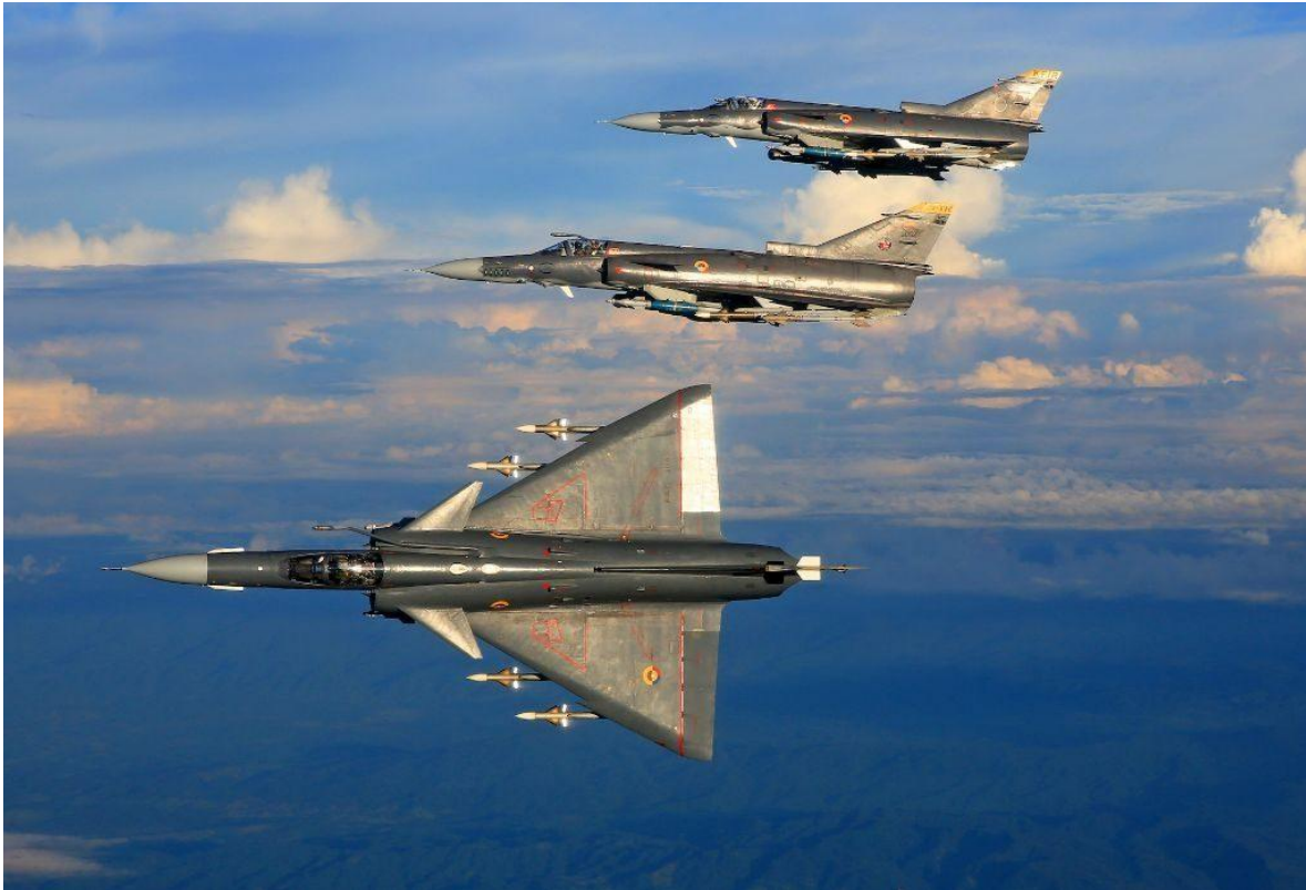
FAC IAI Kfir C.10 fighter-bombers carrying air-to-air missiles and laser-guided bombs.

Free-fall bombs are “dumb” because they can only be oriented ballistically, and once dropped, their trajectory cannot be changed. In contrast, “smart” bombs allow many options and have better features. However, it should not be forgotten that -in general- the smart bomb is nothing more than a dumb bomb with a special guide and maneuver kit attached to its ends.