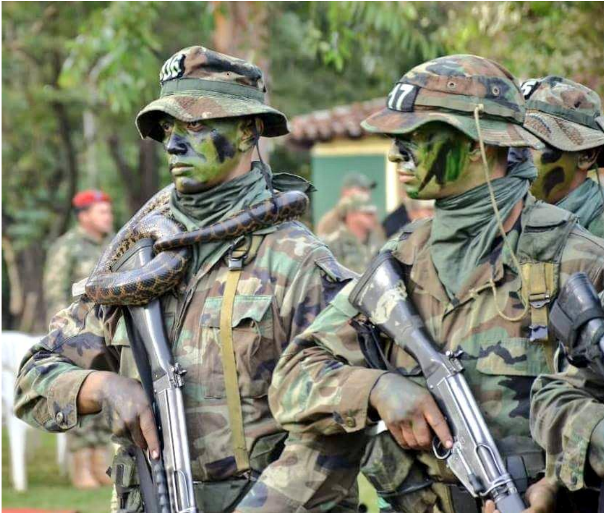
Special Troops of the Paraguayan Army.

Through a military coup on the night of February 2 and the morning of February 3, 1989, the division general and Stroessner's father-in-law, Andrés Rodríguez, overthrew him, forcing him to resign and leave the country as an exile to Brazil, where he lived the rest of his life until his death on August 16, 2006. Rodríguez called for free elections and a National Constituent Convention in 1992, in order to promulgate a new National Constitution. From then on, the President of the Republic also holds the title of Commander-in-Chief of the Armed Forces of the Nation, regardless of his civil or military status, and the institution tends to shrink.