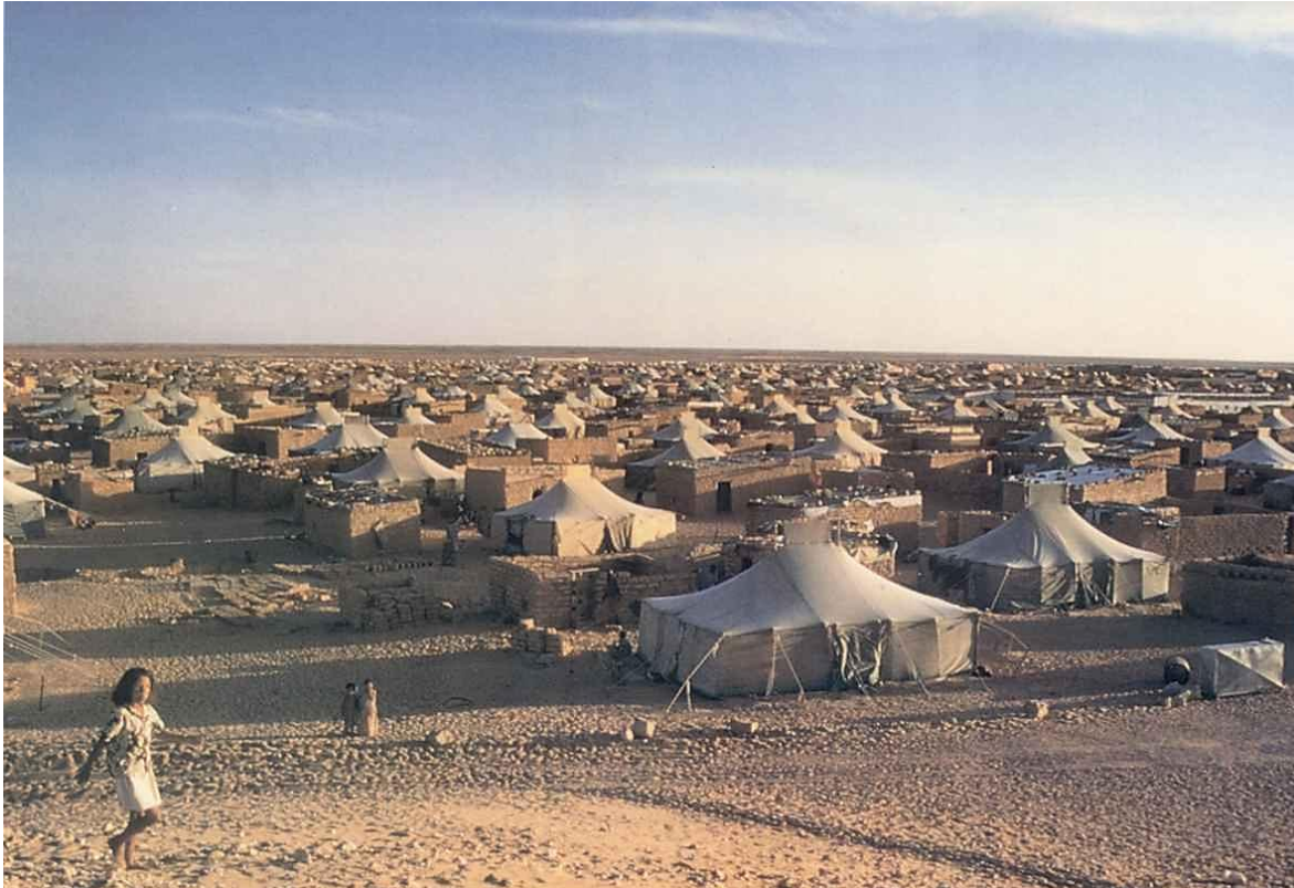
Saharawi camp in Algeria.

Morocco, under the cover provided by Madrid, Paris, London and Washington, continues its advance to, once and for all, exterminate the resistance of the Saharawi people , who for forty-five years have been seeking to establish themselves with all rights as what they is: the Saharawi Arab Democratic Republic (SADR). (See: Western Sahara: The World's Most Ignored War. )