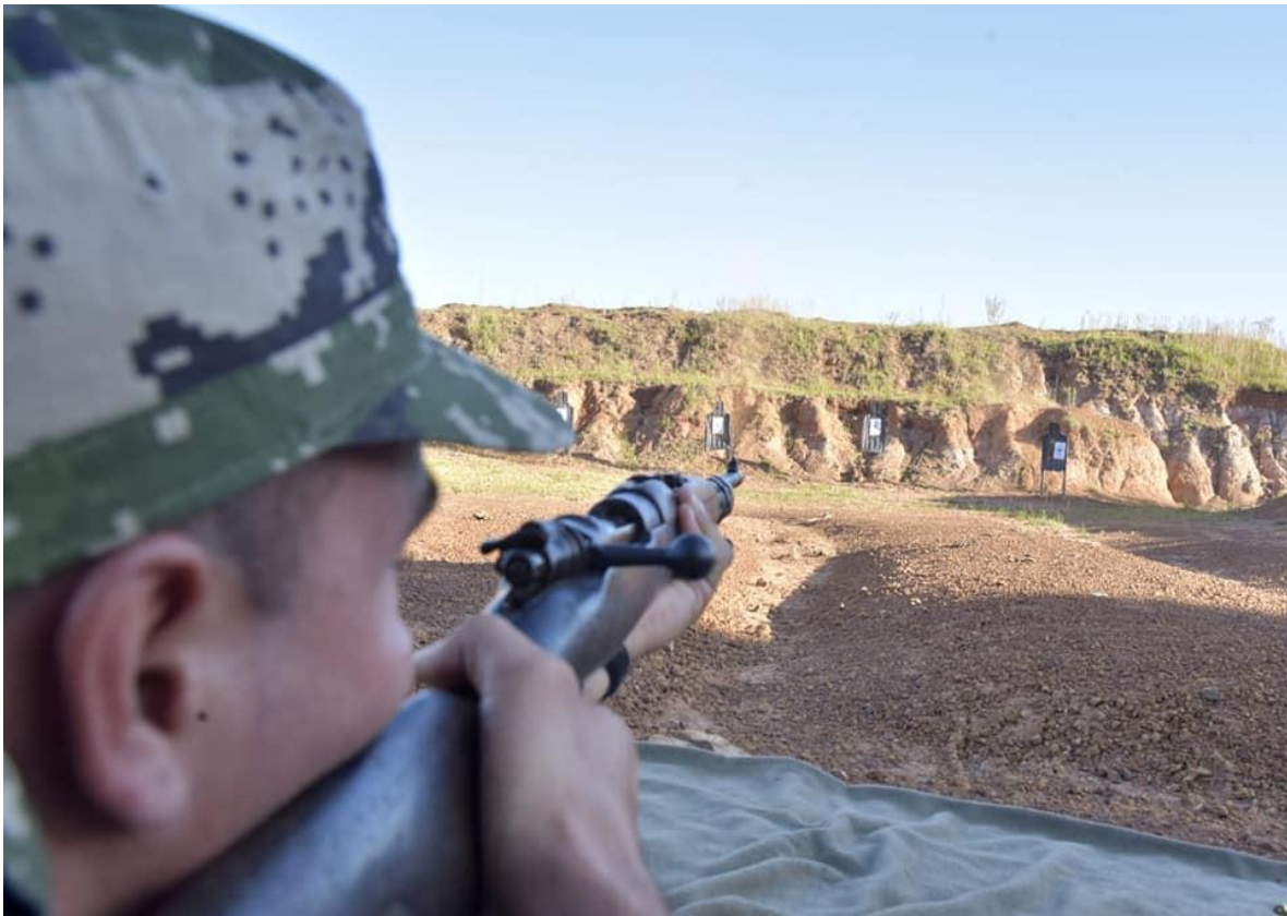
This rifle testifies to the obsolescence of much of the material used by the Paraguayan Army.

The CIMEE also manages the CIMEFOR (Military Instruction Center for Students and Training of Reserve Officers), present in each military unit in the country for the fulfillment of the SMO (Compulsory Military Service) of secondary students.