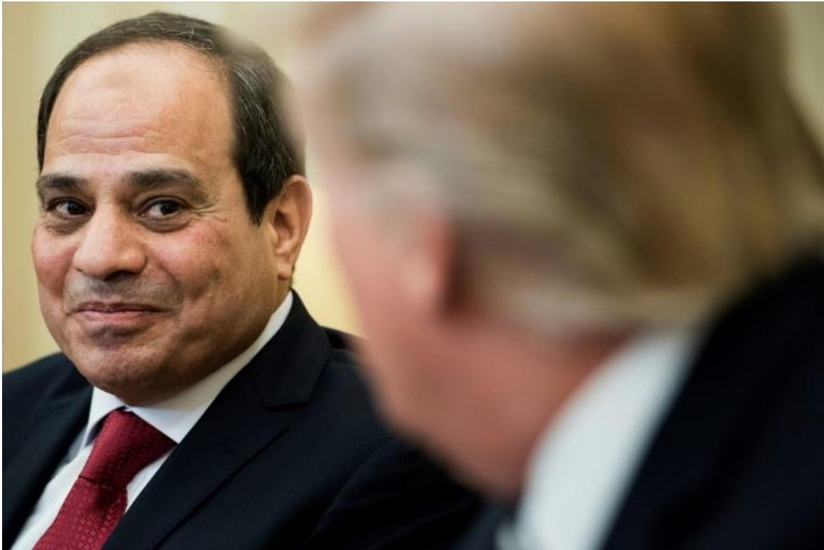
Abdelfatah Said Hussein Khalil el Sisi, Trump's favorite tyrant.

The Egyptian group affiliated with Daesh , Willat Sinai , which since February 2018 has resisted Operation Sinai , designed by the high command of the army, to eradicate terrorism that not only operates in the peninsula, but in almost the entire rest of the country, such as the western desert and with more discreet deployments in the vicinity of the Suez Canal and whose turning point was the attack on the Rawda Mosque , in the city of Bir-el-Abab on November 24, 2017, which killed 311 faithful.