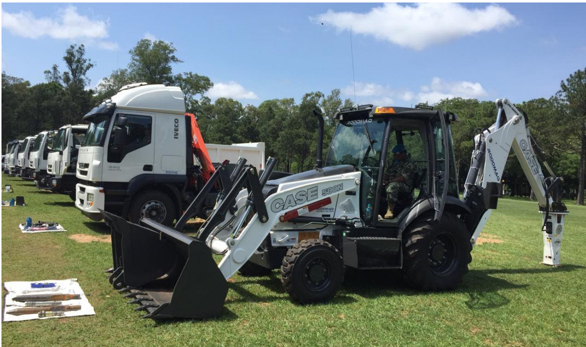
The engineers of the Paraguayan Army contribute greatly to the development of the country.

Logistics Command. Seat: Asuncion. It is made up of 10 general directorates and a military hospital.