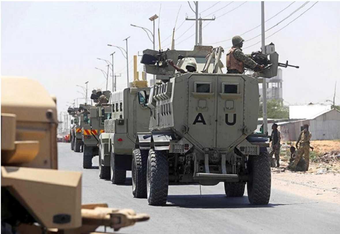
African Union troops on patrol in Somalia.

As part of his troop withdrawal strategy from the different conflicts in which the United States is involved, such as Afghanistan and Iraq, US President Donald Trump also announced the withdrawal of the amount assigned to Somalia, between 700 and 850 Special Operations soldiers , which are distributed in small groups at different bases throughout the country and whose "official" function is to advise the Somali army on counterterrorism. Fundamentally, the elite Somali special forces known as the Danab (Lightning) Brigade, made up of about a thousand men who, since 2014, have operated in four of the five Somali states and to which the United States also provides intelligence and air support. Having carried out 80 percent of the