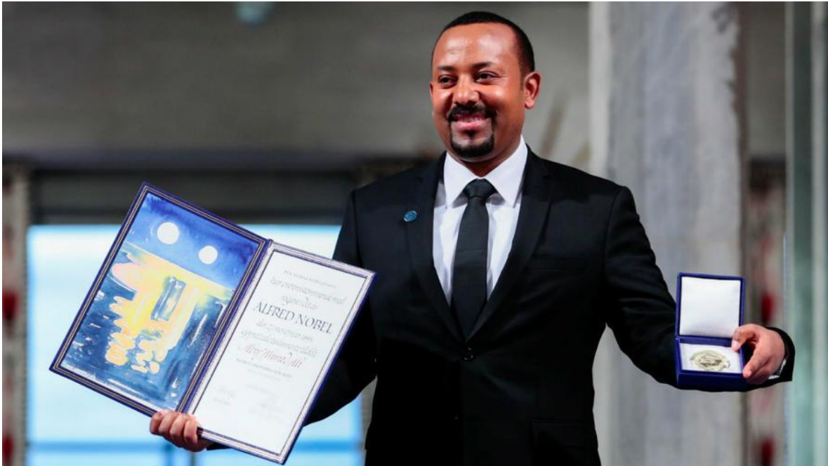
Abiy Ahmed receiving the Nobel Prize.

Two weeks after the conflict began in the Tigray region, in northern Ethiopia, (See: Ethiopia: From an ethnic war to a regional conflict), Prime Minister Abiy Ahmed, gave the rebels, on Sunday 22, a period of 72 hours to surrender. Warning, that the federal forces are already "in the third and final phase" of their military operation in the separatist region. That since the beginning of the month different areas, including its capital, Mekelle and surroundings or woreda, which add up to a population of nearly half a million inhabitants, have received air attacks, without even an approximate number of casualties being known, although it is estimated it easily exceeds a thousand, given the strict information control established by the commanders of the Ethiopian army that operates in the region, added to the cut off of all communication services, particularly cell phones and the Internet. Although if it is estimated more accurately that between 40 and 50 thousand citizens of Tigríños have managed to take