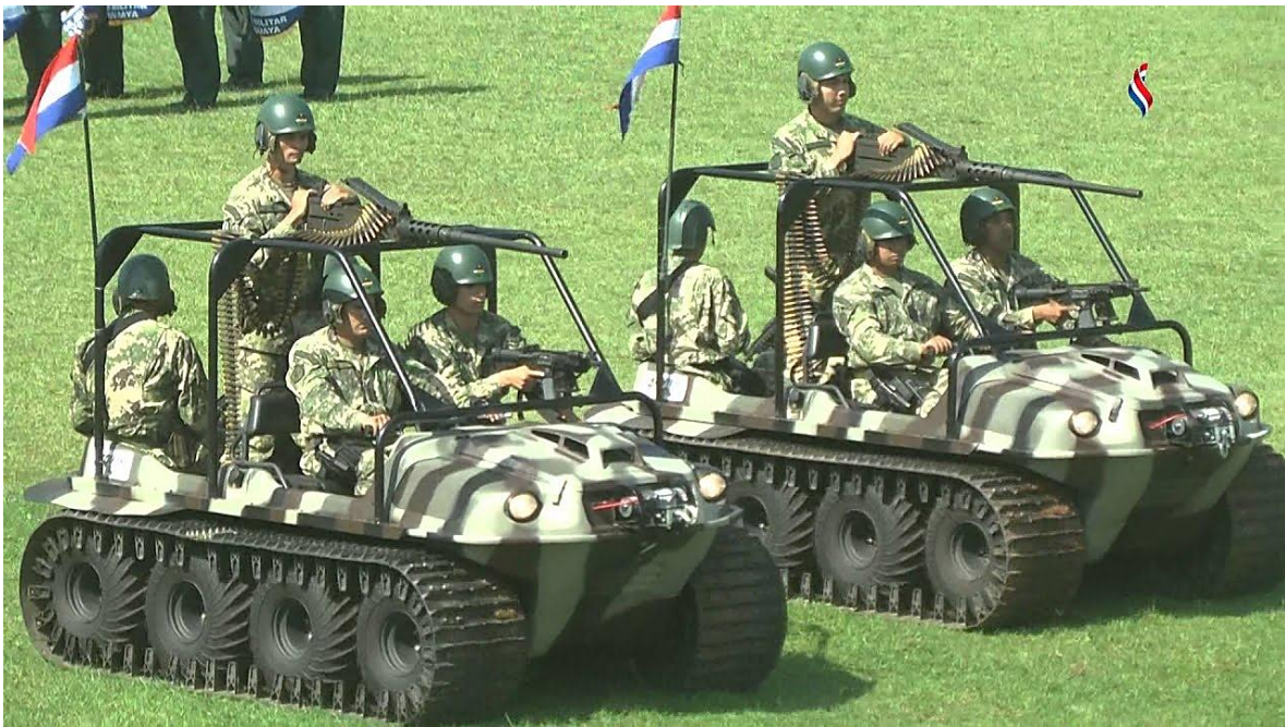
All-terrain and amphibious vehicles recently acquired by the Paraguayan Army.

The Paraguayan Army is composed of a Presidential Escort Regiment made up of two battalions (PM and Infantry), an armored section and an artillery battery (this regiment is equipped with three M-4A3 Shermans, four EE-9 Cascavels, four EE -11 Urutú, three M2 with 20 mm cannon, four M-101 105 mm howitzer). It could be said that this “flagship” unit of the military governments is structurally and materially the strongest in the Paraguayan Army, the Presidential Escort Regiment is an autonomous unit from other commands.