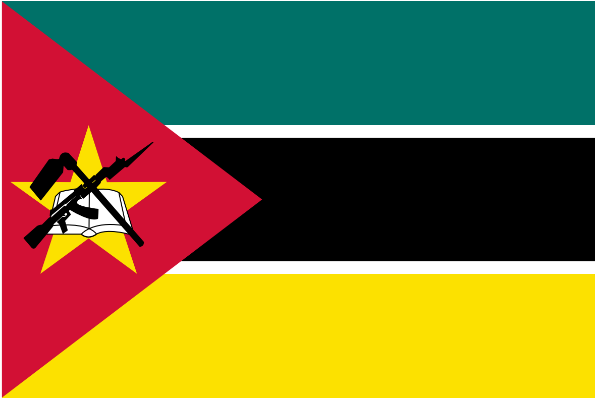
Mozambican national flag. Note the presence of an Ak-47 rifle.

What timidly began in October 2017 with the first actions of the insurgent group, affiliated with the global Daesh , commonly known as al - Shabbab , by the Somali fundamentalist group, although its true and increasingly resonant name is: Ansar al-Sunna ( Followers of the Traditional Path or Defenders of Tradition), which operates primarily in the province of Cabo Delgado in northern Mozambique, has now become a nightmare, not only for the inhabitants of the region and the authorities both local and national, but also for the strong investments that different emerging companies , particularly the French Total , are making after the discoveries of rich gas and oil deposits about sixty kilometers from the coast. Reason why President Emmanuel Macron