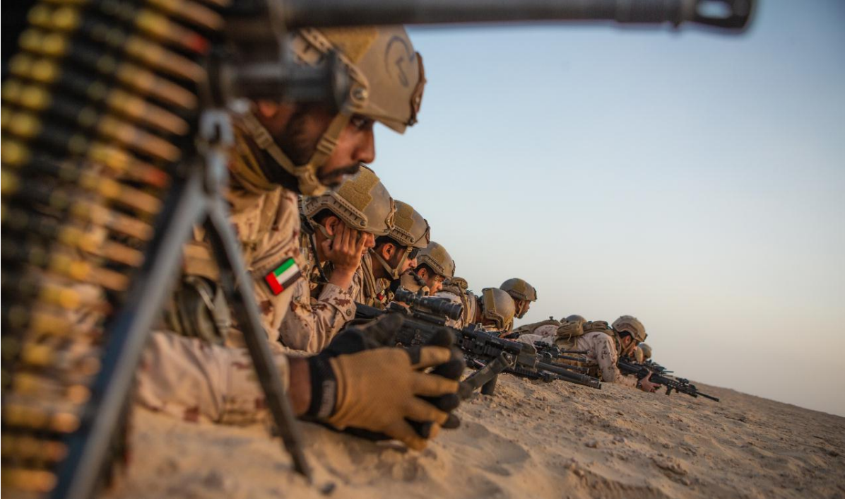
Emirates soldiers in desert training.