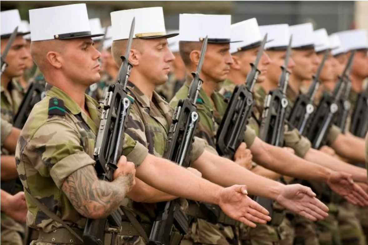
Foreign Legion. Historic French colonial instrument.