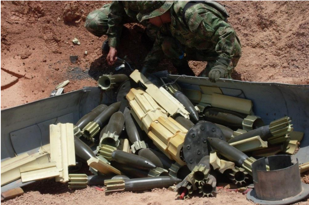
Destruction process of a cluster bomb type ARC-32, at the base of Marandúa , Vichada.

During the 1990s, the Colombian Air Force acquired from Chile a batch of CB-250K model bombs (each one carrying 240 submunitions), and from Israel a batch of ARC-32 bombs (each one with 32 submunitions). In 2006 they were used for the first time to destroy drug trafficking tracks in remote places of the Colombian geography. For the year 2008, Colombia adheres to the Oslo Agreements for the prohibition of cluster bombs, and in compliance with said international agreements, proceeds to destroy its inventory of these weapons, which at the time consisted of 42 CB-250K and 31 ARC -32.