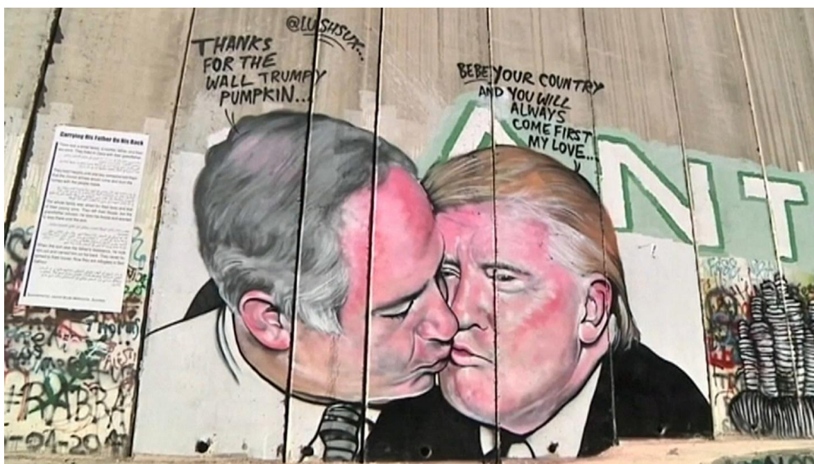
Graffiti in Israel that caricatures the relationship between the leaders of the United States and Israel.

Those who are in charge of keeping the statistics of deaths from Covid-19 will face a serious crossroads when writing down President Donald Trump on the forms, because although he still lives and aspires to resist in the Casablanca, which Hitler degraded in the decadent Führerbunker, at Gertrud-Kolmar-Straße 14, Berlin. There is no doubt that Trump has been killed by the pandemic, along with almost 250,000 other North Americans, due to the disregard with which the 45th president of the United States faced the health crisis.