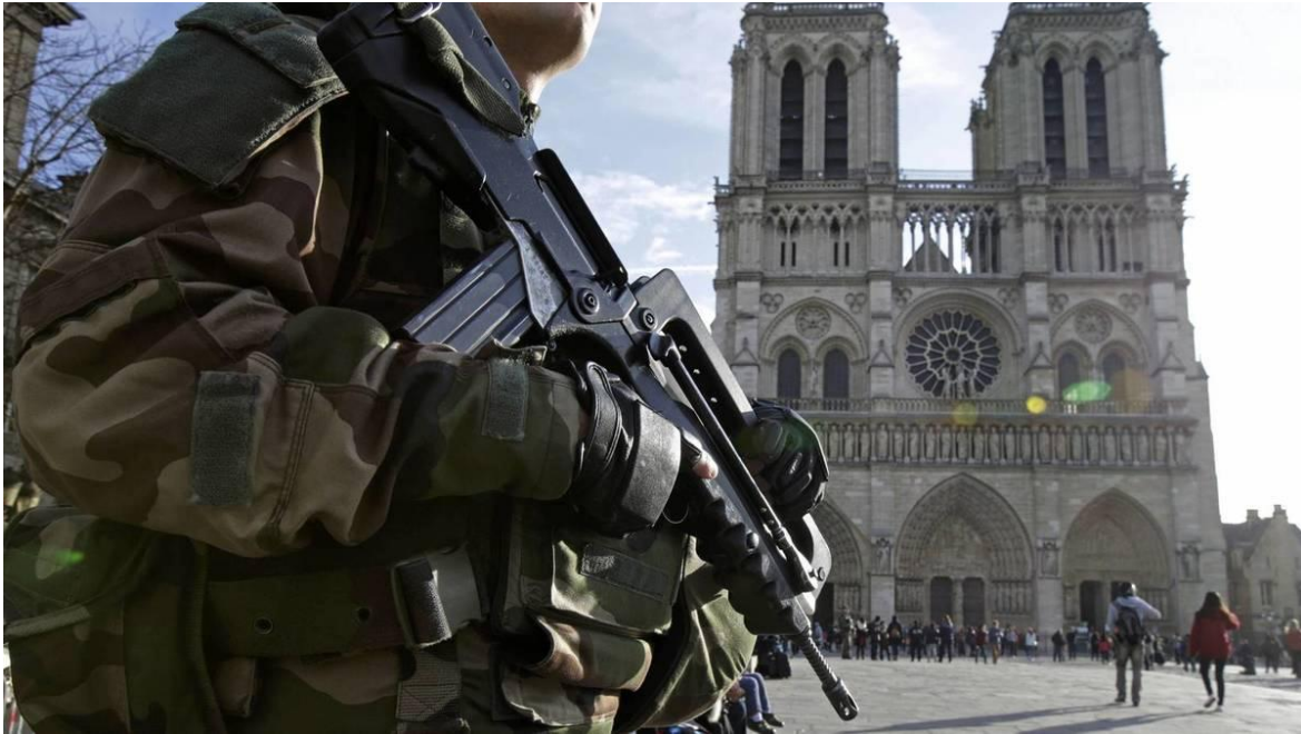
French troops patrol the streets in anticipation of new attacks.