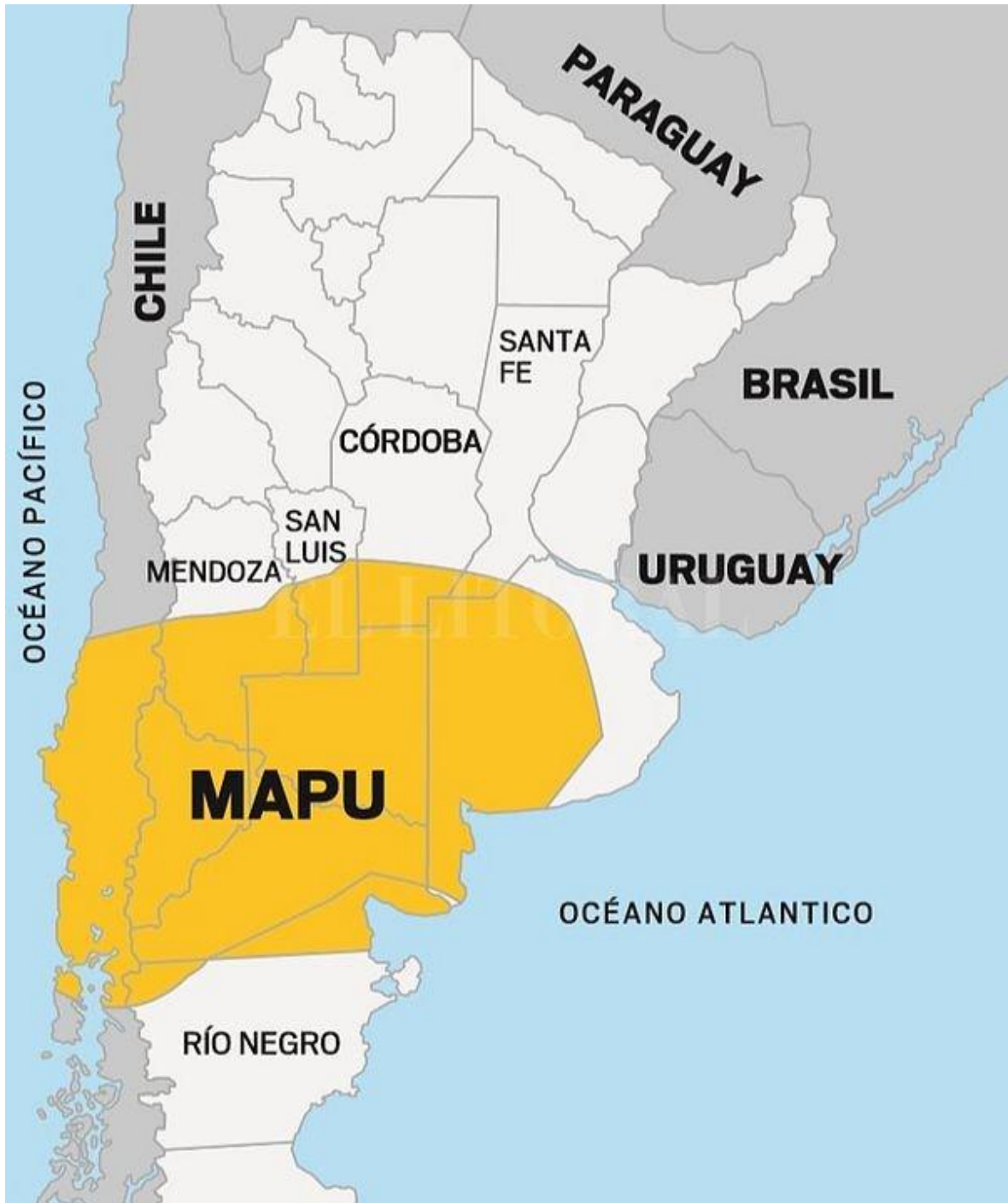
Map of the Mapuche conflict and Argentine-Chilean areas they claim for their people.

New attacks Mapuches extremist groups have occurred in the year 2018 in southern Chile and Argentina, among which fires sheds and machinery or clashes with security forces with Molotov cocktails and roadblocks and occupation national parks and tourist facilities, causing serious disruption to the industry. The modus operandi is the same, they are always small groups of hooded men with different types of