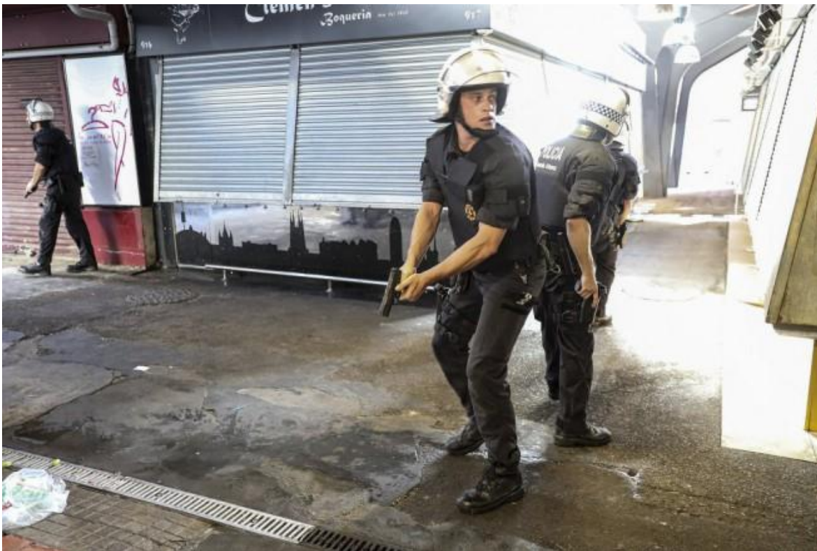
The police chase in La Boqueria market perpetrators of the attack on August 17, 2017.