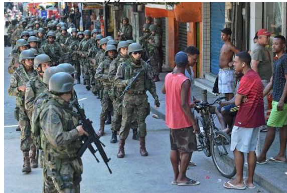
O exército interveio no rio por ordem do presidente.

Terrorism in politics enters when security priority is only political campaign speech, because in reality it does not exist. The basses wages and the poor work equipment are superfluous in the responsibility that is far from the thieving governors.