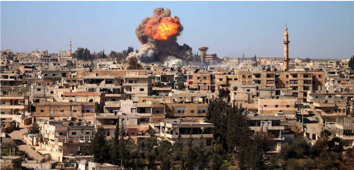
Explosion of a car bomb in a pro-government Syrian post, during clashes between rebel fighters and regime forces to take control of an area in the southern city of Daraa on February 20, 2017.

By Francisco Javier Blasco, Colonel (r) (Spain)