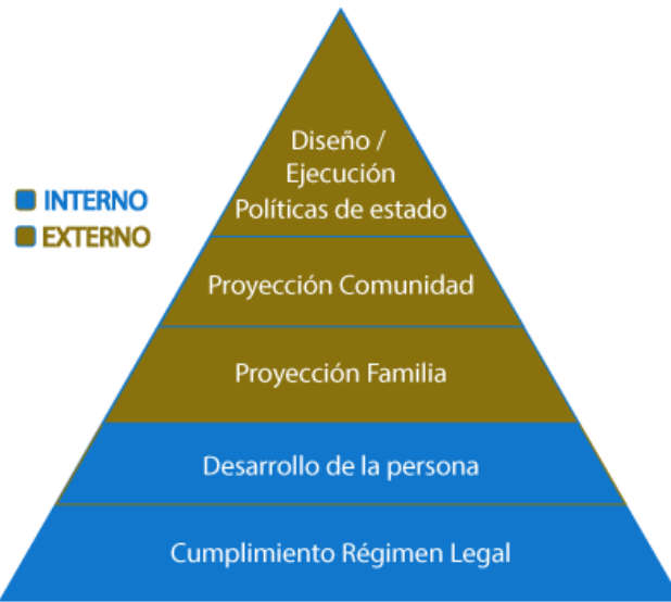
Image N ° 3. Corporate Social responsibility (CSR).

Thus, in its internal dimension, the Organization must ensure to comply with the regulations and the laws of the country where it operates. You are having an ethical conduct, guided by values and transparency. Then, the Organization should be responsible with the people who make it, creating safe environments, good working environment, appropriate incentives, and especially developed to maximize the potential of their capital human, that is in the end, which makes it possible to the business.