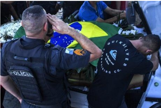
Em 2017, 132 policiais foram mortos no Rio.