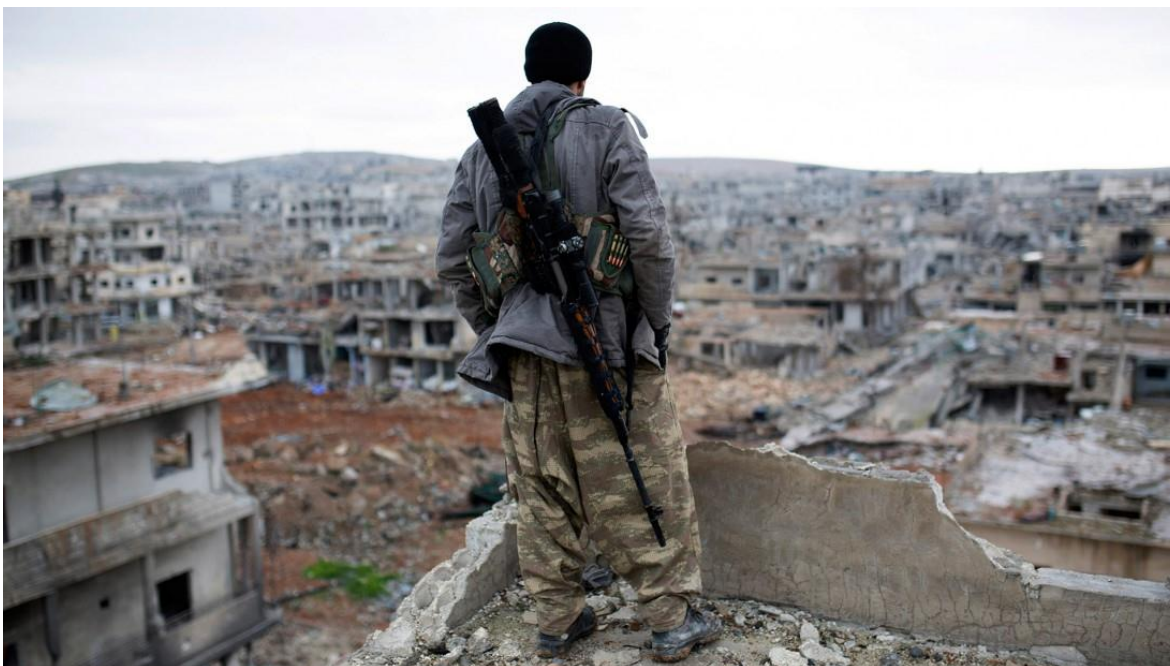
The confrontations in Syria between the different actors of the conflict, have led to the destruction of important urban sectors and other infrastructure. Since fighting continues in many places, recovery becomes difficult.