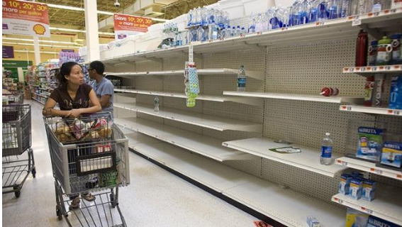
Depleção na Venezuela

countries of Latin America, especially the Brazil, about 50,000 Venezuelans came here after the worsening of the political-economic crisis.