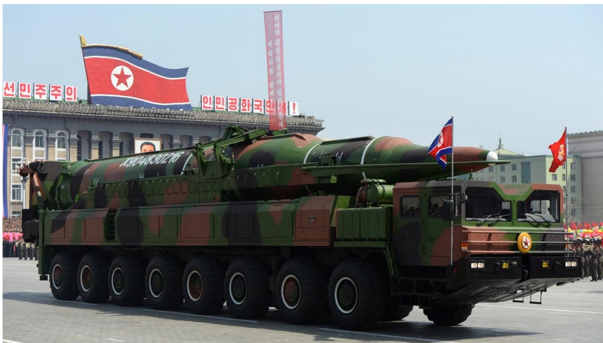
North Korea have nuclear arms, and missile technology. This combination is very dangerous for the rest of world.

Three years ago published an extensive work on the (CN) North Korea in which entitled the country as a permanent threat to the world peace [1]. Actually, this issue emerges and it flares up from time to time but is nothing new as you can deduce from the review of the history of their movements and threats by their leaders with the issue of proliferation and the possibilities of use of their weapons of destruction on massive (ADM) - mainly nuclear - and the means for their transportation and driving.