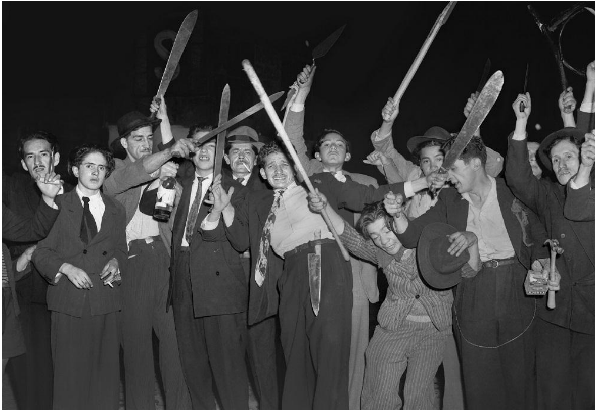
Violence beginning (again...)

several Liberal sectors which criticised its poor economic performance and the alleged corruption of his second term, and ends in 1958 when the parties to the conflict agreed to a settlement which was named "National front".