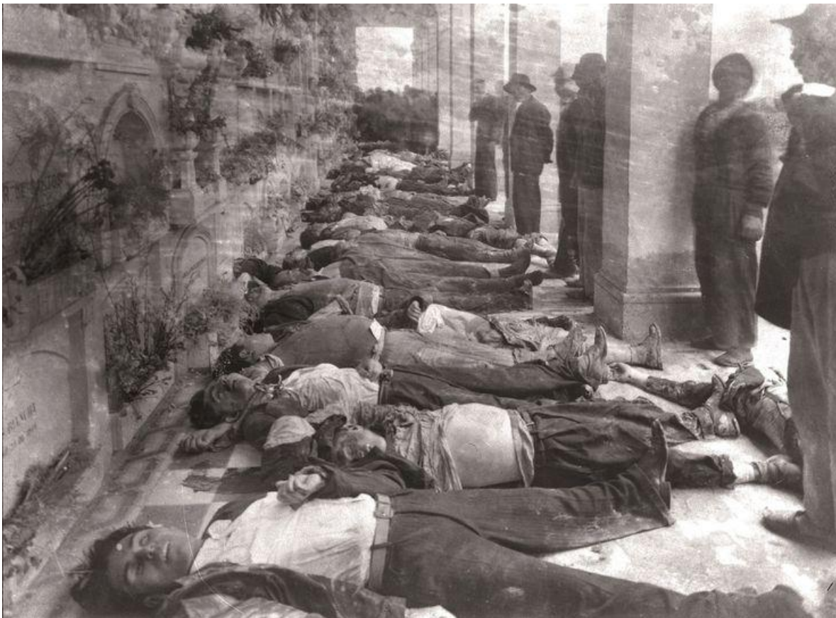
Central cemetery

At the end of this horrible period, more than 10,000 liberal guerrillas left weapons, dealing with the different processes of amnesty.