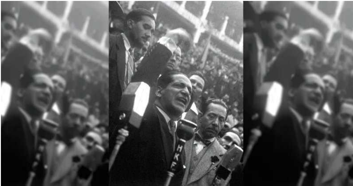
Jorge Eliecer Gaitán "El Caudillo del Pueblo" (the leader of the people).