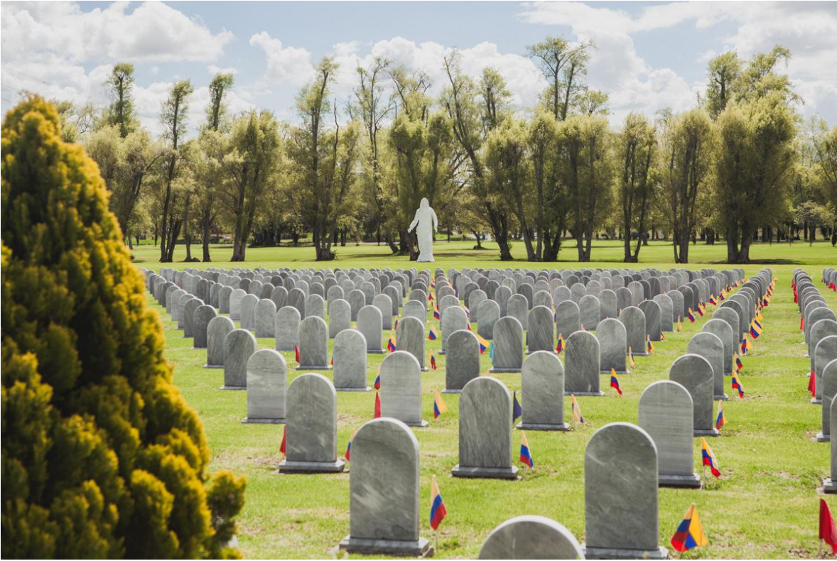
Military Cemetery in the city of Bogotá, Colombia.

That rest in peace (02-February-1965 to August 31, 1996)