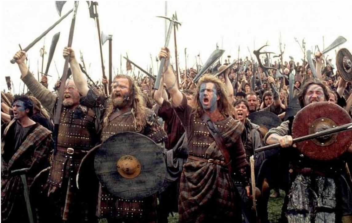
Scene from the movie "Brave heart"