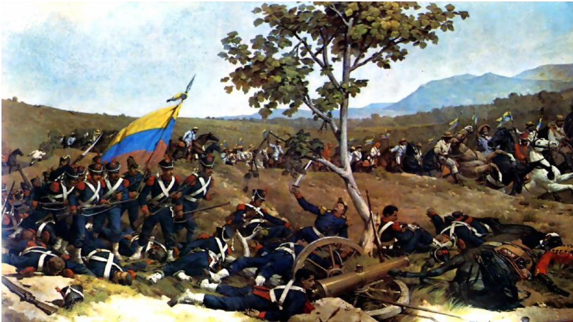
"Carabobo" work of the painter Martín Tovar and Tovar (1827-1902), represents the bloody battle.