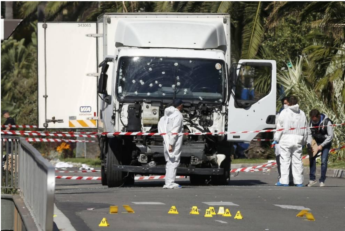
Investigators examine the truck used in the bombing in Niza.

Niza, Germany, London, even Times Square, etc ... something they have had in common with the related low cost attacks committed with pedestrians, have read well, pedestrians.