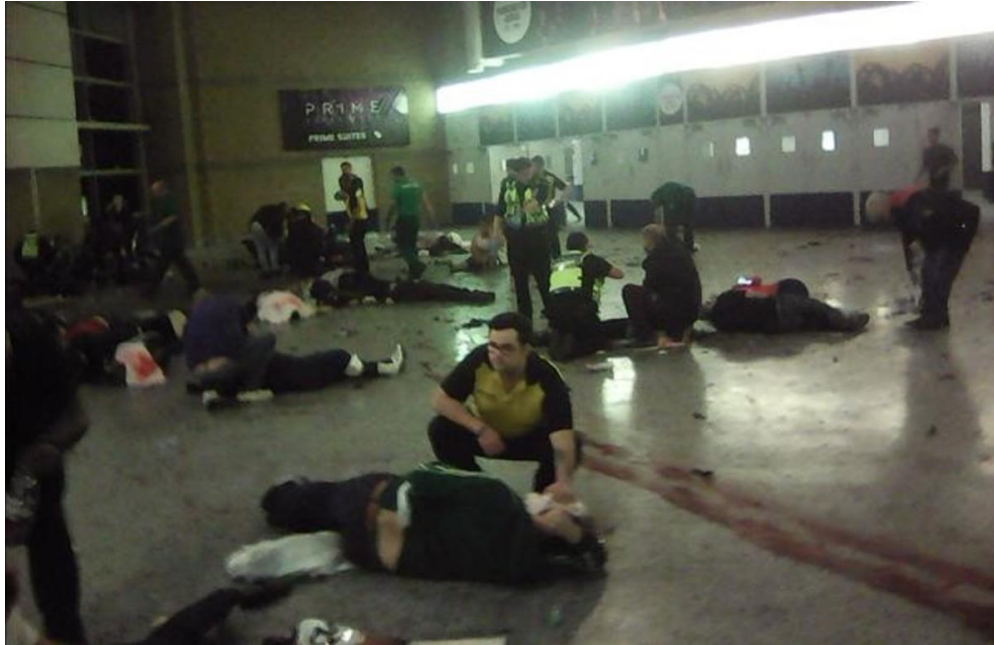
Wounded at the Manchester Arena.

I had been collecting information about security in soccer stadiums, shopping malls, bus terminals, hotels, etc. for a few weeks. And before beginning to write the article, the bombing of the Manchester Stadium happens, which unfortunately has done me good to gather information of interest.