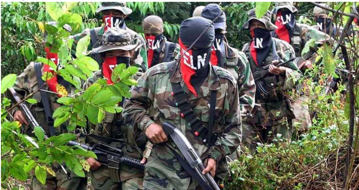
Guerrillas of the National Liberation Army

Juan Manuel Santos Calderón is the seventh president of Colombia who has tried to find a negotiated solution to the conflict that has afflicted the country for 50 years. These attempts to achieve peace have not only been with the FARC but also with other armed groups, including the National Liberation Army (ELN).