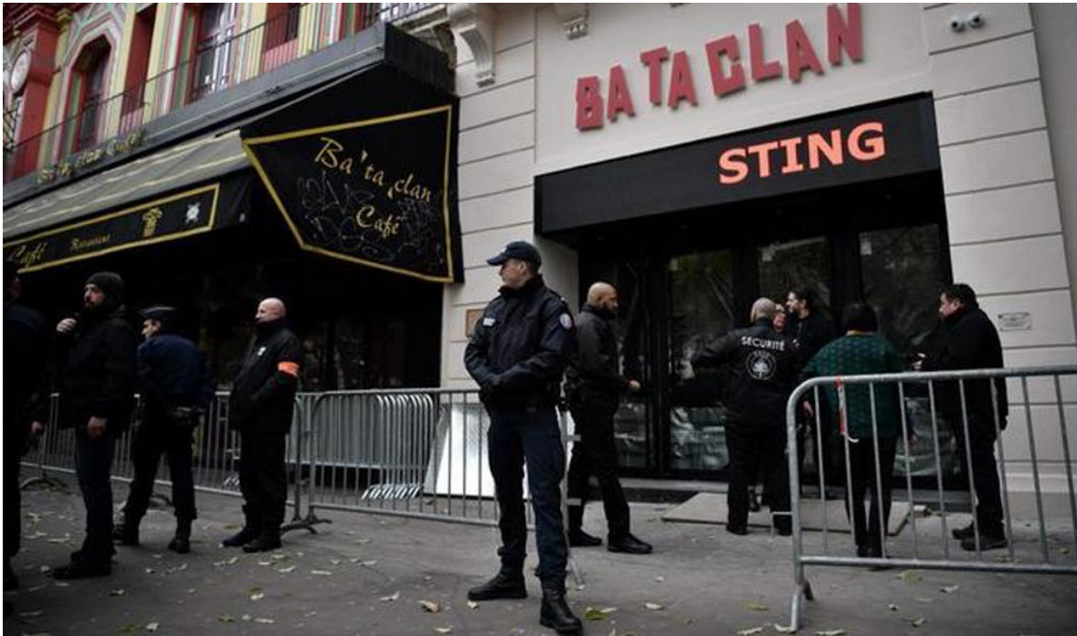
The Bataclan, in Paris - France, reopens a year after the attack, with a concert by Sting.

Terrorism is the act by which attempts are made to frighten the population through violence, the purpose of which is to exert pressure on governments to establish a regime, establish a religious ideology or simply destabilize a government administration by making it appear that it is weak. Nowadays, terrorism does not have a specific definition, since it can be done in different ways. In this respect, international organizations from different countries can not agree with the conceptual definitions of this crime, which is more than anything else. A criminal act of great impact that has been gaining strength and dynamism worldwide.