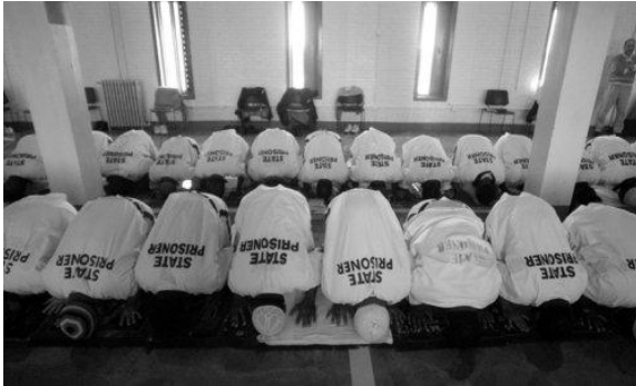
Muslim Prisoners in Prayer

Many issues related to radicalization have been dealt with long and deeply in this newsletter. From a great multitude of opticians, each author has contributed his vision of how this process is developed, what are its characteristics and how individuals can enter or leave the process. It is logical, in fact, that one of the major issues analyzed in these texts is related to how an apparently normal individual can become an extremist willing to fight or kill for his ideology. One of the greatest fears they are trying to establish is precisely this: that we do not feel at ease when a Muslim is near. And precisely because of this, this analysis is so important from different perspectives.