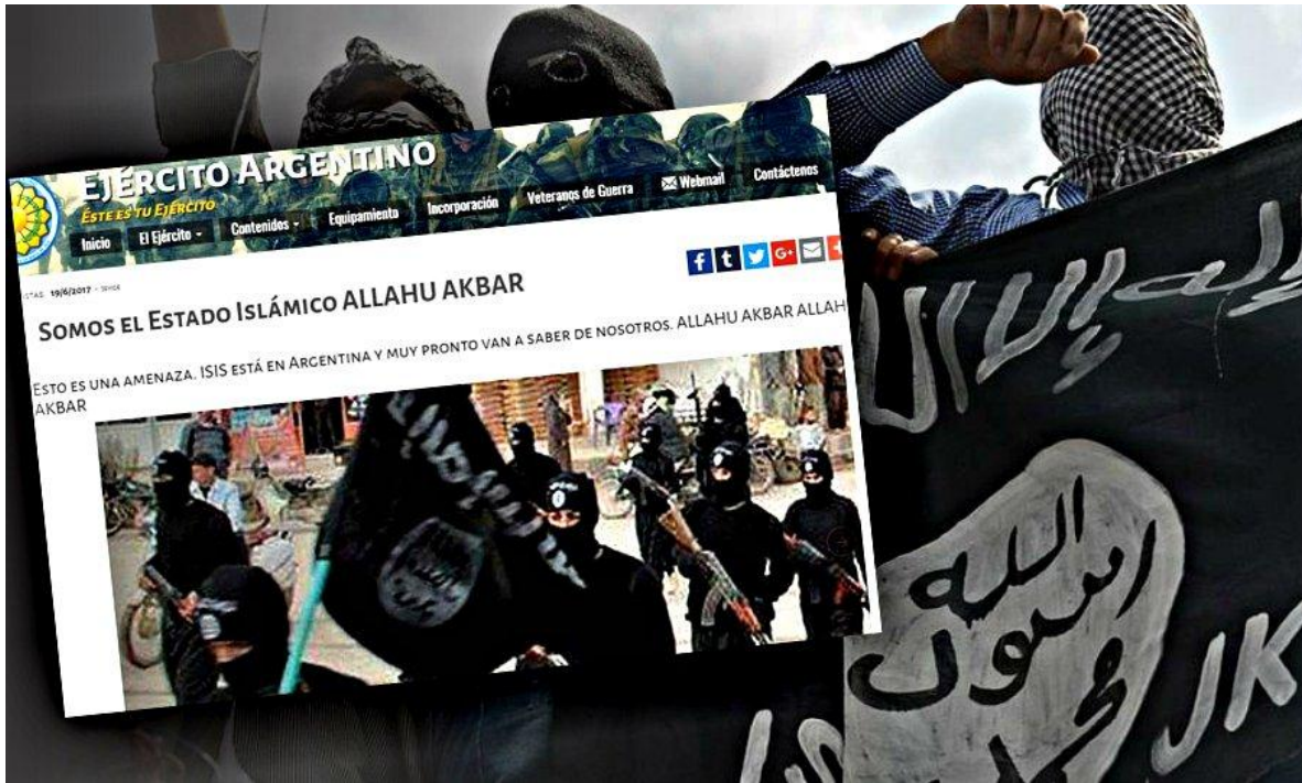
ISIS hacked the official page of the Argentine Army

Every time we connect in the networks, we see more and better prepared soldiers of the DAESH Cyber-Caliphate, where they mark the leadership in cyberspace, to which terrorism of jihadist etiology refers, propaganda, newsreels, radios, groups of Social networks, followed by gears that makes the machine of the cyber-caliphate of the DAESH continue expanding without any remedy, which this propaganda also contributes groups related to its struggle not belonging directly to the DAESH, at least not officially, as can be The group that carried out the hacking of the website of the Argentine Army, where he established a high and clear message in which he threatened directly, indicating "ISIS IS IN ARGENTINA AND SOON SOON TO GO TO KNOW ABOUT US ..."