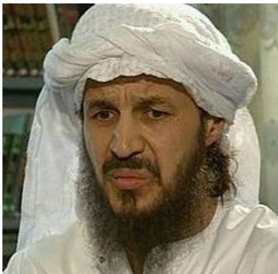
Abu Muhammad al-Maqdisi

In bulletin number 7 of Triarius I wrote about the main historical ideologues of international jihadism. On this occasion I would like to speak of the last living ideologue of this phenomenon. This theologian is relevant because today he still writes speeches and fake referents on how to do jihad around the world. I'm talking about Abu Muhammad al-Maqdisi.